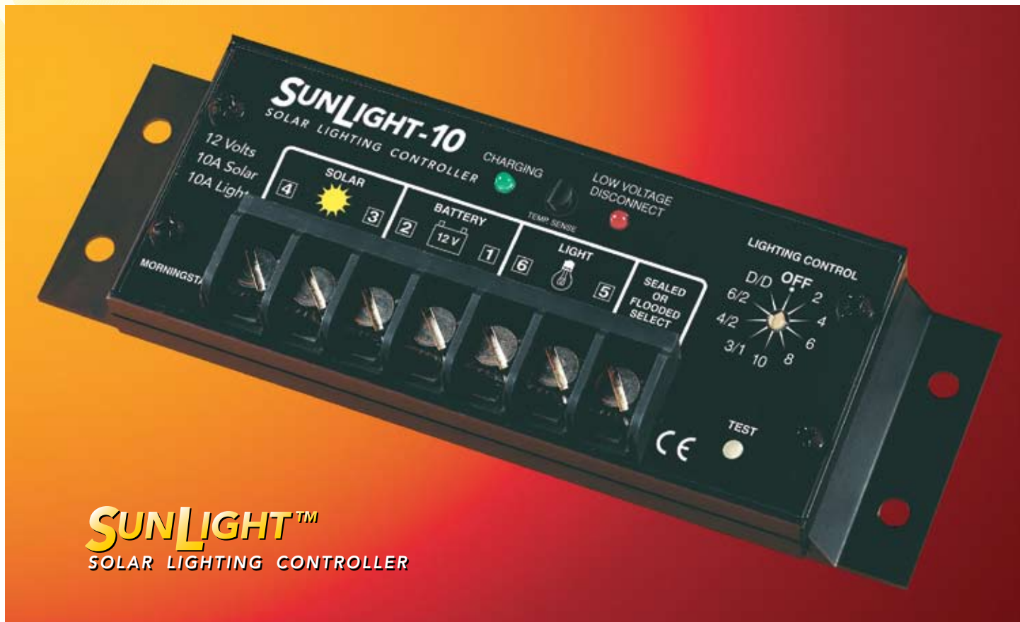
SUNLIGHT™ SOLAR LIGHTING CONTROLLER

Morningstar's advanced SunLight solar lighting controller combines the SunSaver design with a microcontroller for automatic lighting control functions.